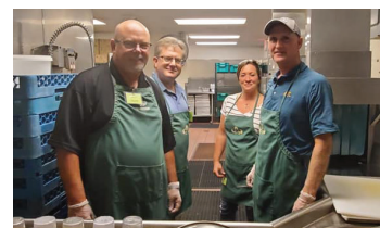
Volunteers from Bluestem, Butler, FreeState, Heartland, KEC, Lane-Scott, Midwest Energy, Prairie Land, Sunflower, and Victory help feed the hungry on Sept. 18.

In addition to the community service event, the group met to discuss topics including crisis communications, the KidWind Challenge, electric vehicle infrastructure, drone technology, Form 990, LinkedIn Learning, social messaging, and a variety of roundtable discussions.