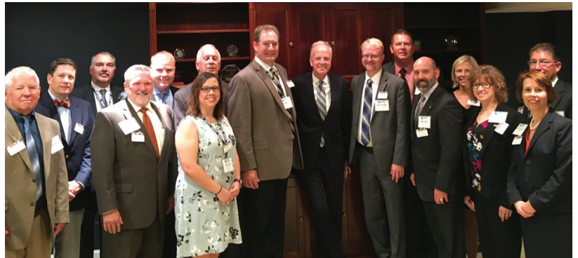
Co-op representatives meet with Senator Jerry Moran during the Kansas electric cooperative fly-in event to Washington, D.C., Sept. 10-11.

Such treatment threatens a co-op's ability to take in federal funds for emergency response, broadband deployment and more. Attendees also discussed broadband deployment needs, the administration's efforts to modernize the Endangered Species Act (ESA), and an initiative co-sponsored by Sen. Moran to incent battery storage research projects, the Expanding Access to Sustainable Energy (EASE) Act.