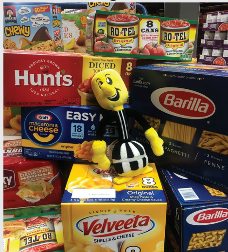
Willie Wiredhand, helps deliver donations of non-perishable food items during the statewide Day of Service canned food drive on Jan. 12.