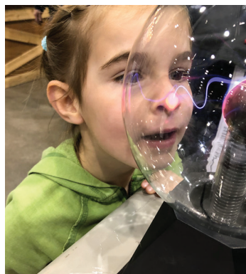
A young Farm Show attendee interacts with the Tesla ball at the co-op booth.

More than 300 exhibiting companies participated in the event that drew more than 22,000 attendees at the Kansas Expocentre in Topeka.