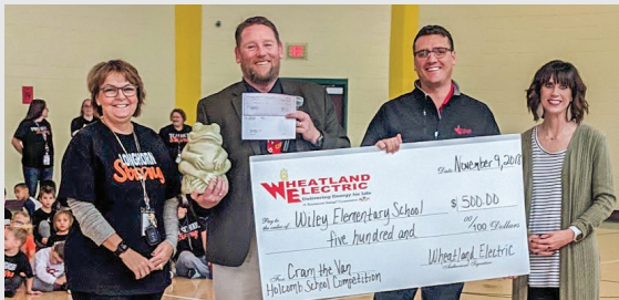
Wiley Elementary students collected 680 pounds of food items, earning their school the $500 Cram the Van grand prize from Wheatland Electric.

incentivize students. Wiley Elementary superintendent matched the $500 winnings to give the Holcomb school $1,000. Wheatland donated a