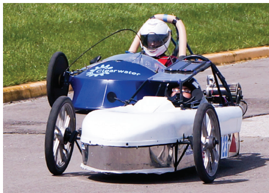
Kansas high school students race hand-built electric vehicles in a prior ElectroRally event.

While the spring ElectroRally races in Kansas were canceled due to concerns with COVID-19, the two state races have been rescheduled for the fall. The High Plains Rally will be Sept. 24 in