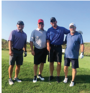
Clockwise from top: Teams from KEC, FreeState, and Pioneer were the top winners of the KCRE Golf Tournament. Next year's 25th Anniversary event will be Aug. 27 at the Municipal Golf Course in Salina.