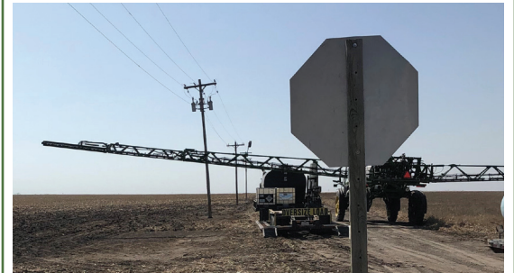
A Kansas farmer dangerously parks a self-propelled sprayer directly under a power line.