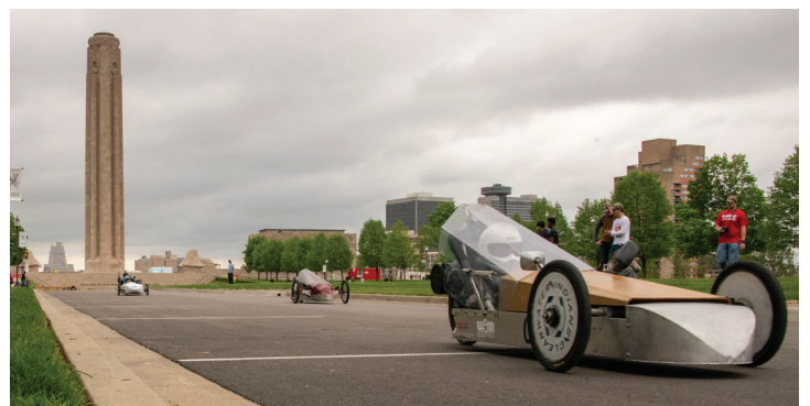
High school teams race electric vehicles during the Touchstone Energy ElectroRally at the National WWI Museum and Memorial on May 3.

Students build vehicles to race in either the Standard Class, that uses only batteries, or the Solar Class, that uses both batteries and solar panels.