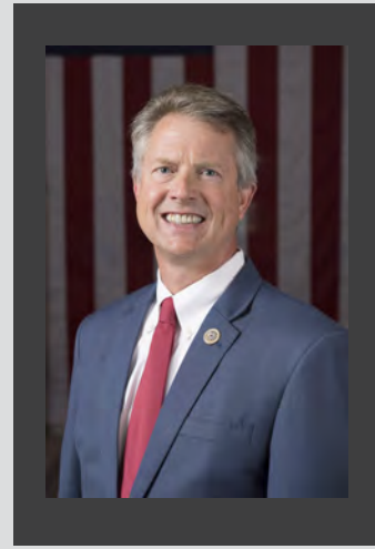
Kansas Congressman Dr. Roger Marshall Member of the U.S. House Agriculture Committee