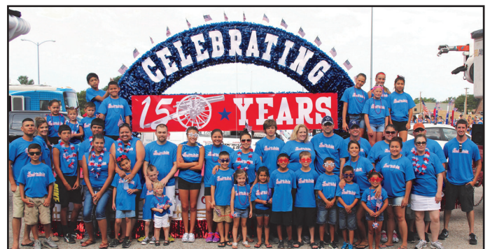
Victory Electric's float gave "Tribute to Fort Dodge."

In the parade, Victory Electric had two line trucks, a float and a trailer for the employees and their families to ride on. In addition to the parade, Victory also grilled burgers for