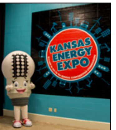
LED Lucy greets fair-goers to the Energy Expo at the Kansas State Fair.

As the building was improved, the commis-