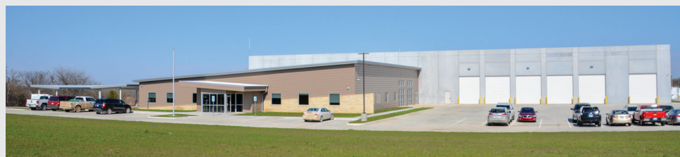
Lyon-Coffey hosted a dedication and open house last month to celebrate its new headquarters located at the intersection of I-35 and 75 Highway (known as BETO Junction).