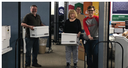
KEC staff boxes up their temporary offices at FreeState this week.

The KEC headquarters efficiency improvement project is coming to a close, staying true to the construction time line that called for completion by June 2018.