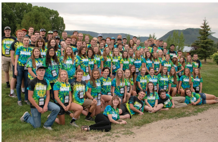
Students representing Colorado, Kansas, Oklahoma, and Wyoming came together for the 2018 Cooperative Youth Leadership Camp.