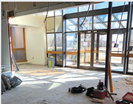
The removal of walls opens up the lobby of the KEC headquarters.

Progress continues with the KEC headquarters efficiency improvement project.