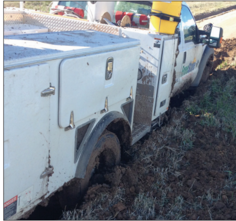
FreeState's truck sinks in the mud while restoring service. Many co-ops used tractors or bulldozers to get trucks to the damaged areas.

"Road conditions were so severe, that for all practical purposes,