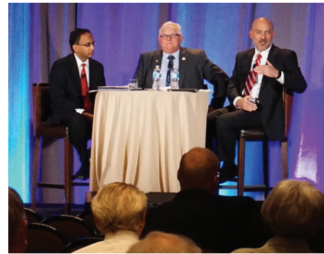
Meeting in Nashville, TN, on Feb. 26-28, 2018.

The Denver meeting was one of five NRECA regional meetings. More than 750 co-op officials from Alaska, California, Colorado, Hawaii, Idaho, Kansas, Montana, Nebraska, Nevada, Oregon, Utah, Washington, and Wyoming were present. These meetings continue the co-ops' grassroots policy making process, which culminates at NRECA's 76 th Annual