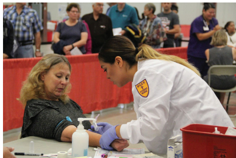
A Victory Electric member has her blood drawn by a medical volunteer at the 10th Annual Community Health Fair in Dodge City.

For the second year, Victory partnered with the "Walk to End Alzheimers" during the health fair. New this year, United Healthcare of Dodge City hosted a community baby shower at the event for new and expecting mothers.