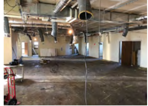
With carpet and fixtures removed, the HVAC and electrical work at KEC's headquarters begins.

After the KEC Board gave the green light for the KEC headquarters efficiency and improvement project at the October Board Meeting, staff relocated to the lower level of the FreeState Electric Cooperative office in Topeka.