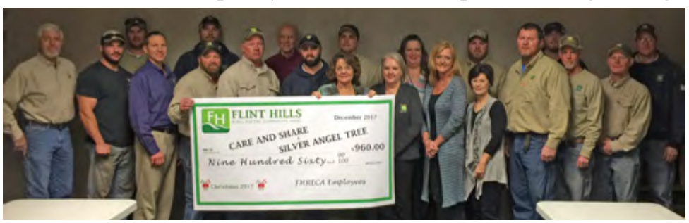
Flint Hills employees pose with a check showing their donations raised to support community Christmas programs.

'Tis the season, and Flint Hills employees know all about the meaning of giving.